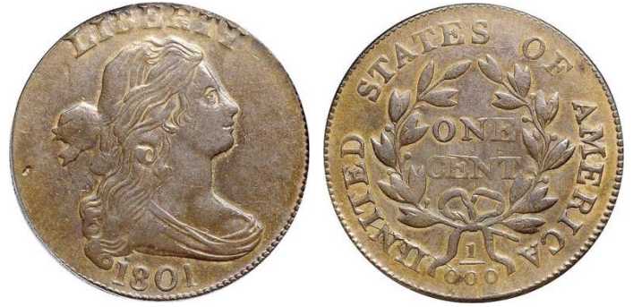
1801 3-Error Cent:

This issue is weakly struck in many instances and the fraction of 1/000 may be difficult to read (even the Red Book™ picture of this variety has a barely legible fraction) especially if there is wear in addition to the weak strike. This is why the “one stem” diagnostic is so important in identifying this variety. Shown here courtesy of NGC’s website is a Mint State example of the 1801 3 Error Cent: