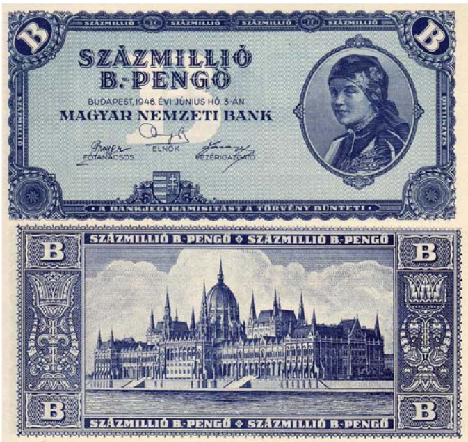
The Hungarian Szazmillio B,-Pengo note issued in 1946 Krause #136

In the November-December, 2007 issue of the SJ CSRA CC newsletter I wrote about large denomination notes. At the FUN show in January, 2008 I was able to obtain the Hungarian Szazmillio B,-Pengo note. It represents 100 million pengo, (100,000,000) and was the highest denomination note ever released. The face portrays of a woman with a head scarf at right and the back shows the Parliament House. In June, 1946, the year this particular note was issued, it was worth only 20¢ in US currency. It is a nice addition to my collection.