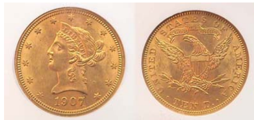
A 1907 $10 gold Liberty Eagle graded MS-62 by NGC

One can muse about all of the could have been situations but it is unlikely that gold will return to the 2005 levels in the foreseeable future anymore than gasoline will sell for $1.39.9 a gallon. The fact is there are still is a number of decent coin buys among late 19 th and early 20 th century gold type coins. These would include gold $1.00 coins and $2.50 Quarter eagles within the certified grade ranges of AU-58 through MS-61. The reader is advised to check the price listings not only to determine the highest affordable grade but at what point a huge price increase occurs to the next grade. For example with $10 gold Liberties the price jumps from MS-62 to MS-63 and with $10 Indians, from MS-61 to MS-62.