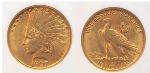
A $1907 $10 gold Indian Head Eagle graded MS-61 by NGC

While at the F.U.N. show some increases were enormous between single digit grades. Certified 1908 $5.00 Liberty gold half eagles were priced at $350 in MS-62, $1,000 in MS-63 and $1,800 in MS-64. In this case, the differences were easily observable. The 62 had lots of distracting marks; the 63 less and the 64 was gorgeous with blazing luster.