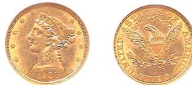
A 1908 $5.00 gold Liberty Half Eagle graded MS-62 by NGC [When magnified to 500%, one will observe a number of surface bruises.]

While at the F.U.N. show some increases were enormous between single digit grades. Certified 1908 $5.00 Liberty gold half eagles were priced at $350 in MS-62, $1,000 in MS-63 and $1,800 in MS-64. In this case, the differences were easily observable. The 62 had lots of distracting marks; the 63 less and the 64 was gorgeous with blazing luster.