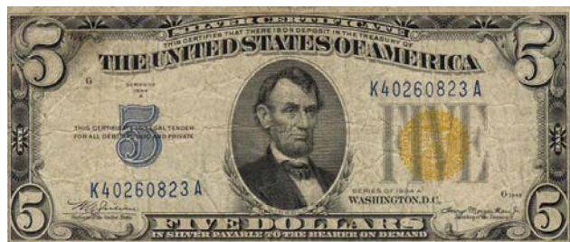
The face of the $5.00 North Africa Silver Certificate

The $10 note is series 1934 (2308), which is quite rare, and 1934A (2309). There is an interesting variation, as well. The North Africa $10 notes were made to look like the Federal Reserve Notes by making the yellow Treasury seal and blue serial numbers green and adding a fake Federal Reserve Bank seal. It is unknown why this would be done, as the notes are still legal tender. These are collectable as well.