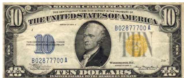
The face of the $10.00 North Africa Silver Certificate

The $10 note is series 1934 (2308), which is quite rare, and 1934A (2309). There is an interesting variation, as well. The North Africa $10 notes were made to look like the Federal Reserve Notes by making the yellow Treasury seal and blue serial numbers green and adding a fake Federal Reserve Bank seal. It is unknown why this would be done, as the notes are still legal tender. These are collectable as well.