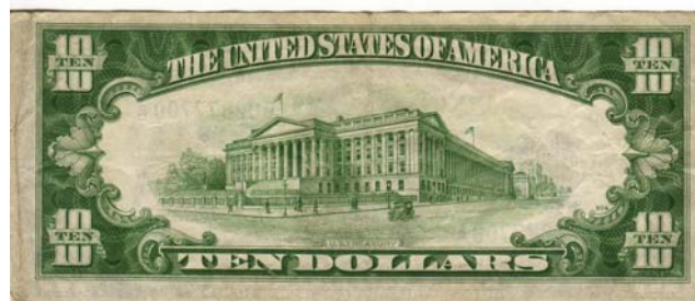
The backs of the three North Africa Notes