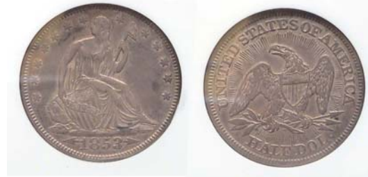
An 1853 Liberty Seated Half Dollar with arrows and rays Graded XF-45 by NGC [Magnify to 200%]

To put a stop to the melting of US silver coins which had increased beyond face value the government authorized a reduction in weight. The half dollar was reduced from 13.36 grams to 12.44 grams. Arrows were placed along side the date and rays were inserted above the eagle on the reverse to indicate the change. Despite the mintage of more than 3.5 million in Philadelphia alone, the demand was extremely high as a one year type. An XF example is modestly priced however.