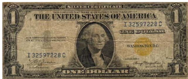
The face of the $1.00 North Africa Silver Certificate

Last month the Hawaii overprint notes were discussed. The North Africa Emergency Notes were the next to be issued.