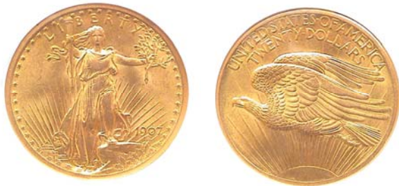
A 1907 $20.00 Saint Gaudens Double Eagle with Arabic numerals The mintage was 361,667 and represents a second type for this denomination struck in 1907. The coin was graded MS-62 by NGC. For transitional date collectors, obtaining both types is a desired goal but with gold prices so high, are they still affordable? [Magnify page to 200% to better view better the details of the design.]