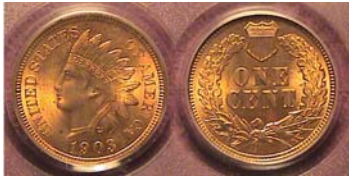
A 1903 Indian head cent graded MS-64 RD by PCGS [Increase page to fill monitor screen to view details.]

During this period in US History the labor force was severely underpaid by the big industrial magnates and despite the unbelievably low prices that existed for basic necessities during this era, wages could barely keep up with the costs with the result that virtually all of the bread winner's wages went to pay the monthly bills. As a result, even common Barber silver coins are scarce today especially in the higher to uncirculated grades.