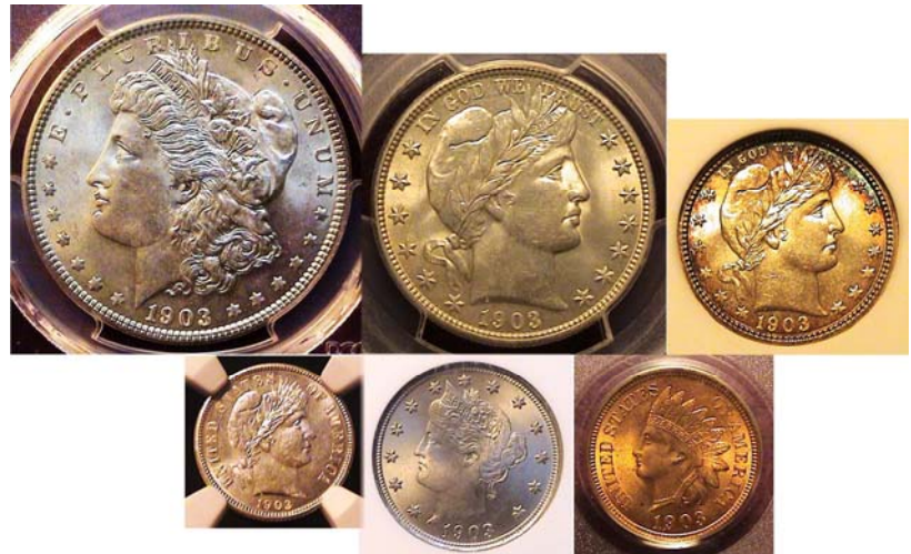
The obverses of a BU set of US Coins from 1903 (excluding gold) [Actual size when printed out. Magnify page top 150% to view details.]

The author's mother was born in New York City in August of 1903, the second of three daughters and grew up in a tenement house located on East 24 th street in lower Manhattan. Her father worked at a hosiery factory but wasn't earning much more than an average wage which back then just enough to pay for the basic items, rent, food, and what utilities were already in place. Electricity was king! Most apartment houses had coal furnaces in the basement for heating and as there was no refrigeration, ice boxes were used which housed large chunks of ice to preserve dairy and meat products. Telephone service was in its infancy and for entertainment, many listened to recorded music on the Victrola, an RCA product. The coinage of that era was used mainly for necessities but also pleasure and actually functioned far better than it does today.