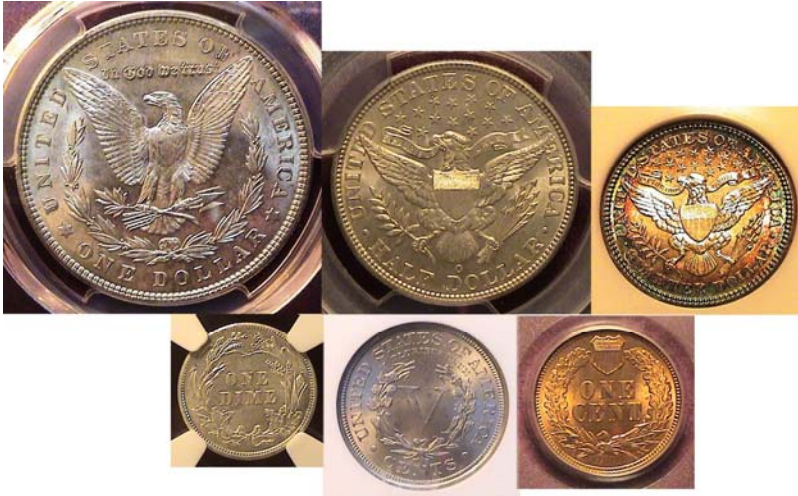
The reverses of a certified BU set of US 1903 coinage From L. to r, top: $1, 50c & 25c; bottom, 10c, 5c & 1c)

During this period in US History the labor force was severely underpaid by the big industrial magnates and despite the unbelievably low prices that existed for basic necessities during this era, wages could barely keep up with the costs with the result that virtually all of the bread winner's wages went to pay the monthly bills. As a result, even common Barber silver coins are scarce today especially in the higher to uncirculated grades.