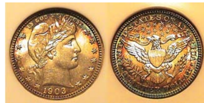
A 1903 Barber quarter graded MS-64 by NGC CAC approved [Increase page to fill monitor screen to view details.]

In 1903, Barber dimes were produced at all three Mints that were currently in operation. 19,500,00 were struck at the Philadelphia Mint, more than the total of the 1903 Barber quarter and half-dollar combined. Only 613,300 were coined at the New Orleans facility and 8,180,000 at the San Francisco Mint. According to the latest Red Book , the 1903-P is listed at only $250 for a MS-63 example, $550 for a 1903-S and a whopping $1,200 for a 1903-O. A proof-63 is listed at $500. Despite these statistics, it took a while before the writer was able to acquire a mint-state example of a 1903-P Barber dime and this occurred at the Blue Ridge Numismatic Association annual show held in August, 2016, the price, just $150. In 1903, a dime had the purchasing power of $2.81.