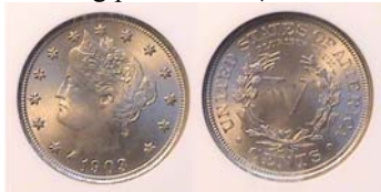
A 1903 Liberty "V" nickel graded MS-65 by NGC [Increase page to fill monitor screen to view details.]

85,092,703 Indian Head cents were struck at the Philadelphia Mint in 1903, a new record that would be eclipsed in 1906. While considered an extremely common date and less expensive than the many of the scarcer earlier dates of this series, locating choice Red-Brown or full Red uncirculated examples presents a challenge to the serious collector. Upon extreme magnification, the coin shown displays a few minor spots on the obverse with minor toning marks on the reverse but not enough to spoil the coin's overall appearance. The piece was acquired at the Augusta Coin Club show in May, 2017. In 1903, a cent had the purchasing power of 28¢.