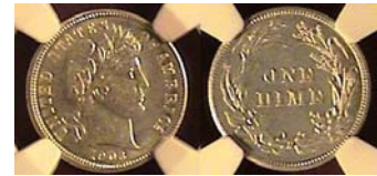
A 1903 Barber Liberty Head dime graded MS-63 by NGC [Increase page to fill monitor screen to view details.]

Despite the large number of Liberty nickels struck during this era, uncirculated business strike specimens are apparently beginning to dry up. One of the signs of this is the increase in proof specimens appearing on the bourse floor and across the internet. In 1903, 1,790 proofs were struck of the "V" nickel with the vast majority being saved as souvenirs. While the number of business strike survivors available to numismatists may still be the same, many more collectors have entered the coin market and dealers can no longer supply business strikes of high quality as they once could..