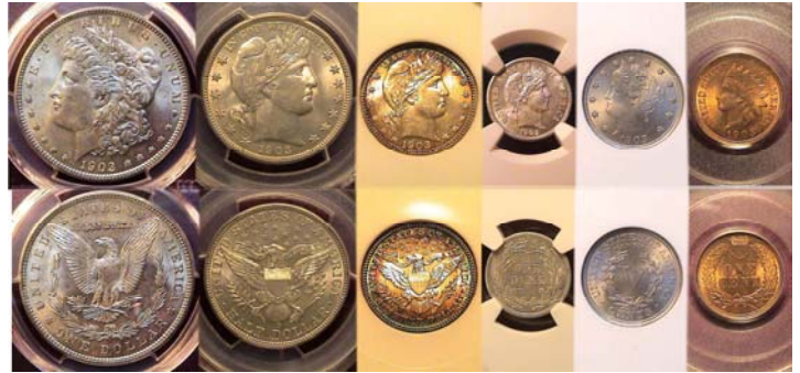
The obverses and reverses of a 1903 certified BU year set (excluding gold) [Increase page to fill monitor screen to view details.]

The 1903-P Morgan dollar is considered to be the best struck date of the series often surviving with smooth surfaces although not overly lustrous. The current retail figure for an MS-64 example is $125.00 according to PCGS' COINFACTS website, the actual price paid by the author at the GNA Convention held in April of 2016. As such, despite its highest monetary value of the six denominations shown for the date, it cost the author no more than the 1903 cent graded MS-64 Red. In 1903, a dollar had the purchasing power of $28.10 but most of the public used the large $1.00 banknotes during that period.