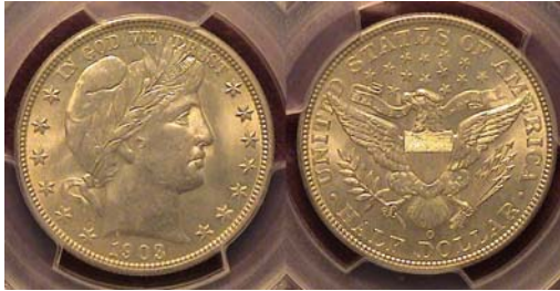
A 1903-O Barber half-dollar graded MS-63 by PCGS [Increase page to fill monitor screen to view details.]

While the 1903-P Barber quarter is a very common date, it circulated heavily during its era and the almost three generations that followed. It's purchasing power was $17.03 in 1903 which accounts for its heavy usage during that timeframe. The suggested retail price on PCGS' COINFACTS web site was slightly lower than what the author had to pay for the example shown on the previous page and most auction prices realized were considerably lower as well, but none of the certified MS-64 examples the author observed exhibited anywhere close to the eye appeal of the coin portrayed in this article.