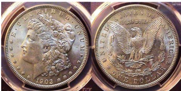
A 1903 Morgan dollar graded MS-64 by PCGS [Increase page to fill monitor screen to view details.]

In 1903, the three Mints struck mintages for the Barber designed Liberty Head half-dollar that were closer in number to each other than any year. Roughly 2,7 million were struck at the Philadelphia Mint, 2.1 million at the New Orleans Mint and 1.9 million at the San Francisco Mint. The 1903-O was not as sharply struck as the Philadelphia Mint issue although it is considered by numismatic scholars of the series to be a much scarcer coin while the 1903-S Barber half is scarcer still. The author acquired the 1903-O specimen shown above at the Augusta Coin Club show held in May, 2017 for a reasonable price after saving up enough money to afford one. Of the millions of Barber halves produced between 1892 and 1915, most of them circulated heavily with the exception of a smaller proportion held back by the wealthy as souvenirs or a collection. Since the laboring class needed every cent of their pay envelope to pay for the basics, it is doubtful that an uncirculated specimen would be saved be handed down from that source. In 1903, fifty-cents had the purchasing power of $14.10.