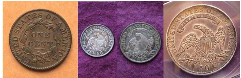
The reverses of the collectible US coins of The cent, half-disme, disme and half-dollar 1830 [Enlarge page to fill monitor screen to view details.]