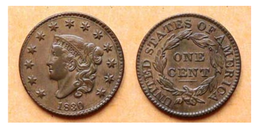
An 1830 Coronet large cent, N-4, R1 grading AU-50 [Enlarge page to fill monitor screen to view details.]

when the people were native Americans or people of color, he did not include them with the regard as the American voters. When it comes to numismatics however, it was during the Jackson administration that our coinage began to undergo at tremendous change but this would not begin to occur until 1836 during Jackson's second term.