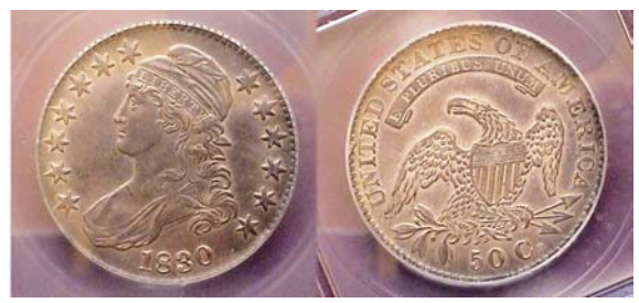
An 1830 Capped Bust half-dollar, O-115, R2 graded AU-58 by ICG (Enlarge page to view monitor screen to view details.]

With the suspension of the silver dollar after 1803, the half-dollar became the highest silver denomination and as such was used by banks as "specie" (hard money) to back investments and loans. As a result, the coin circulated far less than the other lower silver denominations. The coin type was designed by John Reich, an indentured German immigrant who came highly recommended for his engraving skills.. He was hired on a salary of $600 per annum and immediately asked to start redesigning all of our coinage, the first two being the halfdollar and the $5.00 gold half eagle in 1807. As a result, the half-dollar usually received the highest mintage and with the exception of three dates, the 1807, the extremely low mintage 1815 and the 1820, all the remaining dotes were struck between one and six million per year depending on the date. The 1830 had a reported mintage of over 4.3 million and is easily affordable up through AU-50.