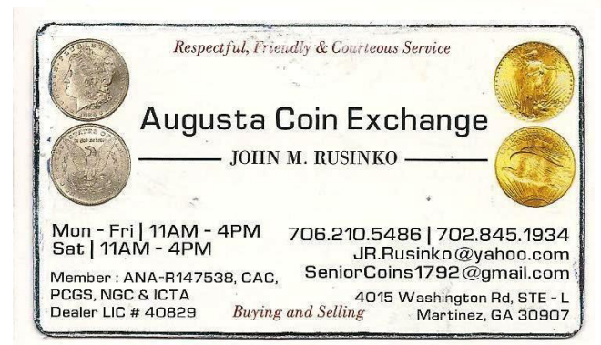
Editor's Note: Beware when something is too good to be true