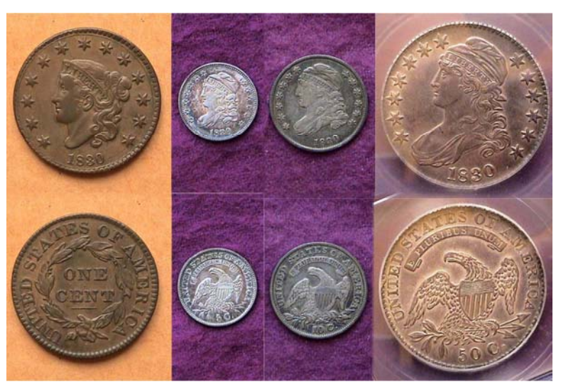
A four denominational set of collectible US coins dated 1830 (Enlarge page to view monitor screen to view details.)

In 1839, fifty-cents had the purchasing power of $14.00.