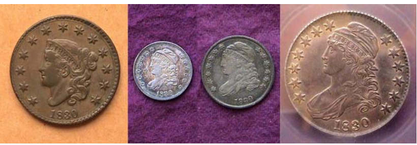
The obverses of the Collectible US coins of 1830 The cent, half-disme, disme and half-dollar [Enlarge page to fill monitor screen to view details.]

In 1830 the population of the United States had increased to 12,866,020 from the 9,638,453 taken in 1820 census. . Savannah was listed as the 37^{th} most populated city in the nation with 7,303 citizens followed by Augusta, the 42^{nd} with 6,710 and Columbia, SC listed as 78th with just 3,310. If you're wondering about Atlanta, it didn't exist except as an end of the RR line tiny hamlet called Marthasville.