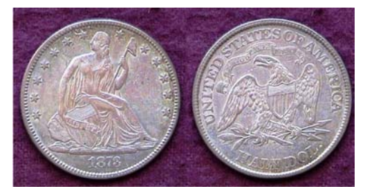
An 1873 Lib. Std. half-dollar with open 3 in date \ graded XF-45 by PCGS [Enlarge page to fill monitor screen to view details.]

The author acquired the more common 1866-S with motto away back in 1996, when it was only worth $90.00. It was graded XF-40. At a coin show in 2003, he acquired the scarcer 1866-S no motto Lib. Std. half graded VF-20 for a price of $325. Today the no motto VF-20 sells for around $900 while the 1866-P Lib. Std. half with motto graded XF-40 is valued at $450 according the 2023 Red Book.