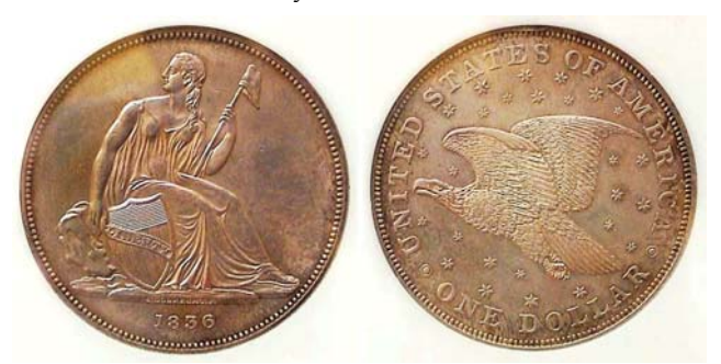
An 1836 Gobrecht Liberty Seated dollar graded AU-58 by NGC [Enlarge page to fill monitor screen to view details.]

Collecting Gobrecht Liberty Seated half-dollar types By Arno Safran