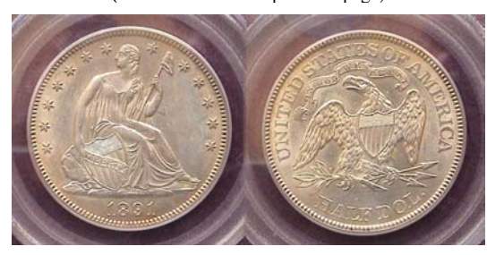
An original striking 1891 Liberty Seated half-dollar with motto WB-101, R3, graded MS-62 by PCGS; the final year of the series

Unlike all the previous low mintage Liberty Seated dollars produced from 1879 thru 1890, 200,000 were struck in 1891, the final year of the Liberty Seated type. The author acquired the MS-62 graded coin shown directly above at the 2009 FUN show held in Orlando, FL. He thought that it should have been graded at least MS-63. "Should have been!", "Might of been!", "Why wasn't it been?". Upon increasing the size of the page from 100% to 150%, the author found no reason for the coin graded "MS-62" and not MS-63. Even when magnified to 200%, the coin still appears" original" and mark free but if one magnifies the page to 500%, a- ha!!!; there are tiny nicks that appear on the surfaces of Miss Liberty's dress where it covers her legs and a few along side it in the coin's field, which explains why the lower grade was applied. Nevertheless, it is the author's opinion that most viewers would have still acquired the coin despite these miniature factors because it is beautiful to behold and represents the final year of the Liberty Seated type's existence; especially with the half-dollar denomination because it never received the revisions that Robert Ball Hughes substituted best seen on the quarter and dollar.