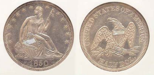
An 1850 Mid-century proof-like 1850 Liberty Seated half-dollar certified AU-58

Since the series including the Gobrecht Liberty Seated Liberty half-dollar spanned 42 years, one would think its value during its existence changed substantially. The records show, that in 1840, 50 cents had the purchasing power $13.40. By 1891, it has risen to just $15.40. That's just $2.00 by our contemporary standards, suggesting, not very much, but for the two generations living in the second half of the 19<sup>th</sup> century, $2.00 would have been quite a lot: approximately $60.00.