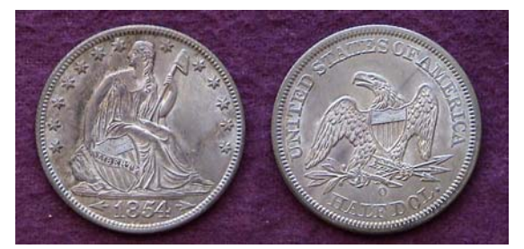
An 1854-O Liberty Seated half-dollar with just arrows at date WB-R-101. R3 By PCGS graded MS-62 [Enlarge page to fill monitor screen to view details.]

Unlike the quarter denomination, the obverse displaying Miss Liberty on the half-dollar is like Gobrecht's original concept. Like the quarter denomination, the arrows at the date and the rays on the reverse were added to both the 1853-P and O half-dollars to inform the public that the silver content in the coin was reduced accordingly. Only four to five of the original 1853 without arrows exist while the mintage for the 1853-O (New Orleans) coin shown above was 1,328,000 yet is considerably expensive due to popularity with one graded AU-55 selling for around $1,700s. The coin shown above was acquired by the author for only $650 but that was back on May 3, 1991 at a huge Coin Convention held in New York City.