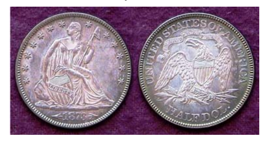
An 1873 Liberty Seated half-dollar with arrows at date graded AU-55 by PCGS

This variety is extremely rare and expensive despite the reported mintage of 214,200 minted at the Philadelphia Mint and is priced at an awesome $13,500 in the 2023 Red Book . This specimen is courtesy of the Heritage Auction Archives and is available to the more wealthy numismatists.