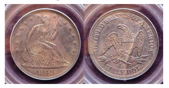
An 1849 Liberty Head half-dollar graded AU-58 by PCGS [Enlarge page to fill monitor screen to view details.]

In 1839, it was the half-dollar's turn. The three coins shown above display the earlier Capped Bust Reeded Edge halfdollar type followed by the two Liberty Seated types, the middle piece showing no drapery under Miss Liberty's elbow while the example on the far right, shows added drapery slightly further under Miss Liberty's elbow. The motto, E Pluribus unum had already been removed from the reverse of the Capped Bust Reeded edge half-dollar earlier.