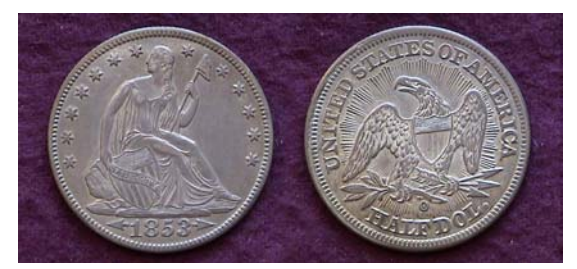
An 1853-O Lib. S td. 50c. with arrows & rays, WB-101, R2 AU-55 [Enlarge page to fill monitor screen to view details.]

While the example of the 1849 quarter is attractive, the image if Miss Liberty appears to have been flattened out and not as artistic as Gobrecht's original design which was retained on the half-dollar.