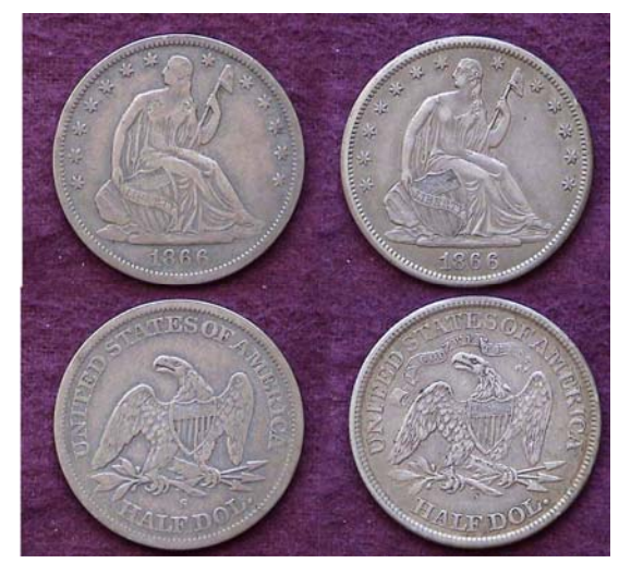
An 1866-S WB-101, R4+ Lib. Std. half-dollar without motto at left with an 1866-P WB-102, R3+ Lib. Std. half with motto at right [Enlarge page to fill monitor screen to view details.]

In 1866, the motto, IN GOD WE TRUST --which first appeared on our two-cent copper pieces in 1864 while the Civil War was still going on--began appearing on many of our larger coins in 1866, a year and a half after the war had ended. The San Francisco Mint however, did not learn of the changeover until after it had already struck 60,000 with no motto , an example shown on the left. Once the new information was received it would strike an additional 994,000 with the motto, "IN GOD We TRUST while the Philadelphia Mint produced 744,900, an example shown on the right.