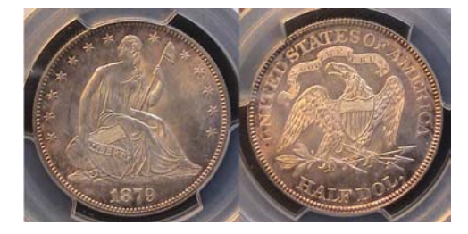
An lovely 1879 Liberty Seated half-dollar with motto graded MS-63 by PCGS

To show the increase in silver weight from 12.44 grams to 12.50 grams arrows were placed around the date later in the year on the 1873 Liberty Seated halves and once more in 1874, The coin above is well struck and was affordable back in 1995 when the author acquired it at a Garden State Numismatic Association Convention held New Brunswick in June, 1995.