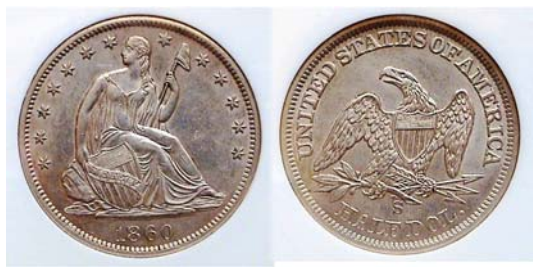
An 1860-S Liberty Seated half-dollar graded AU-55 by NGC [Enlarge page to fill monitor screen to view details.]

In 1860, the Liberty Seated quarter was struck at the Philadelphia, New Orleans and San Francisco mints with the first named producing the most examples, 800,400 and easily the most acquirable and affordable of the three mints in which the 1860-S is considered scarce to rare. The date usually comes unevenly struck on the stars surrounding the Miss Liberty on the obverse but this example appears sharply struck on both sides of the coin. In 1860, a quarter had the purchasing power of $7.93.