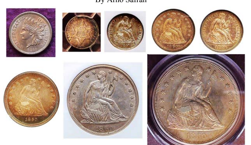
The obverses of the US coinage of 1860 (excluding gold) [Enlarge page to fill monitor screen to view details.]