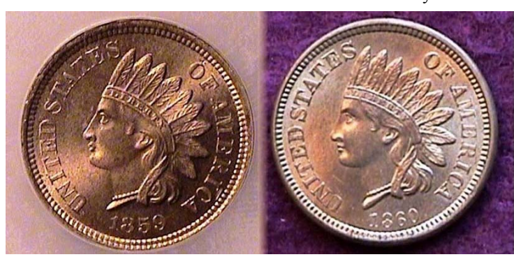
Further enlarged are the two 1859 & '60 obverses Showing more clearly the pointed and rounded neck

In 1860, The Indian cent was struck in its second year but the wreath was altered considerably from the 1859 version to the 1860 coin at right which shows a shield atop a thicker wreath. More subtle, was the slight rounding out of the truncation on the tip of native American's neck from the pointed one on 1859 to the rounded one on the 1860. See directly below.