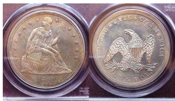
An 1860 Liberty Seated dollar graded MS-62 by PCGS [Enlarge page to fill monitor screen to view details.]

In 1860, a half-dollar had the purchasing power of 15.30.