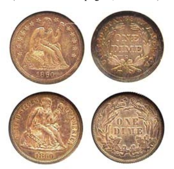
An 1860-S old style over an 1860-P new style Liberty Seated dime [Enlarge page to fill monitor screen to view details.]

Transitional date coins are enjoyable to collect whether they represent two completely different design types such as the 1938 Native American/ Buffalo nickel into the Jefferson nickel or less obvious alterations like the two dimes shown above. Upon enlargement, the viewer can see that the obverses retain the Liberty Seated design but the 1860-S dime shown atop displays the thirteen stars circling Miss Liberty while the 1860-P dime below it displays the legend UNITED STATES OF AMERICA surrounding her. The reason for the disparity occurred because the San Francisco Mint received the word of the change too late before striking the 1860 dimes there.