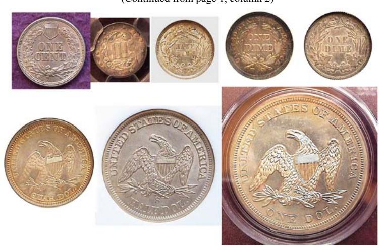
The reverses of the US coinage of 1860 (excluding gold) [Enlarge page to fill monitor screen to view details.]

Shown above are the reverses of the cent, 3c silver trime , the silver 5c half-dime, the two dime reverses along with the reverses of the Liberty Seated quarter, half-dollar and silver dollar. The six gold denominations which included the $1,00, $2.50, $3.00, $5.00, $10,00 and $20.00 double eagle were struck in smaller numbers except for he double eagle that year but all remain fairly expensive in the higher circulated and BU grades and are above the discretionary income for most of us.